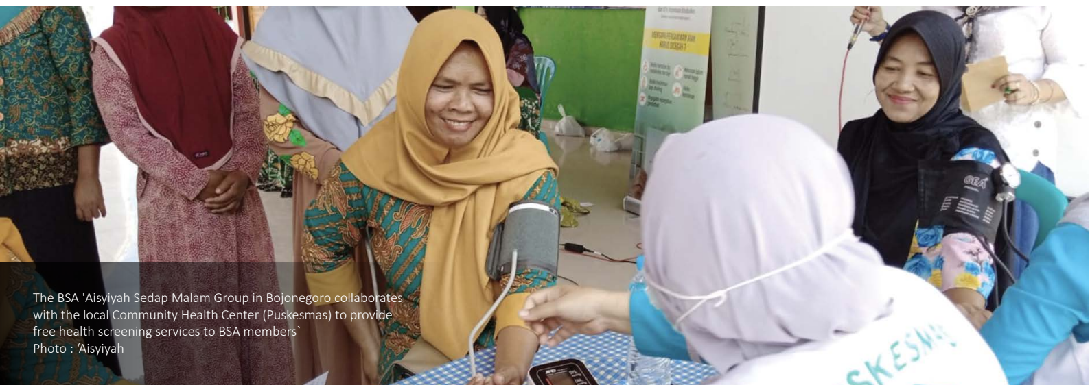
The BSA 'Aisiyah Sedap Malam Group in Bojonegoro collaborates with the local Community Health Center (Puskesmas) to provide free health screening services to BSA members`

Family Economic Development Groups (BUEKA) established in Blado Kulon Village produces seasoning products and peanut rempeyek. Members participate in e-commerce training through Tourism Office/UNAIR Campus collaboration and have received their business licence.