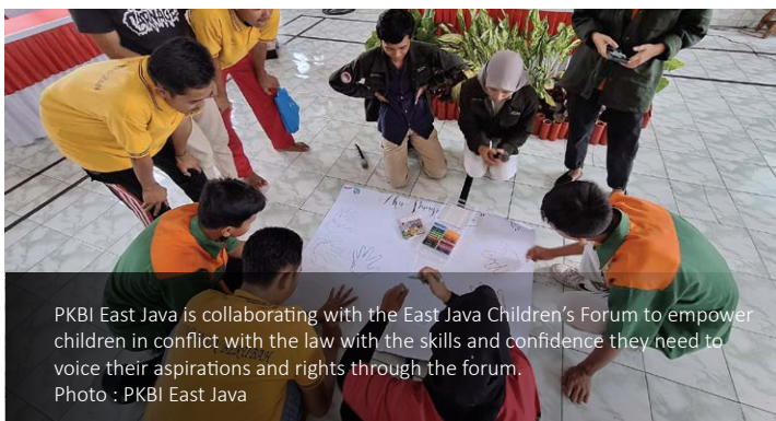
PKBI East Java is collaborating with the East Java Children's Forum to empower children in conflict with the law with the skills and confidence they need to voice their aspirations and rights through the forum.

PKBI assists children in conflict with the law to fulfil their rights to access health, education, and legal services, be free from violence, and support reintegration into their communities.