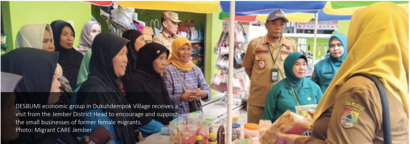
DESBUMI economic group in Dukuhdempok Village receives a visit from the Jember District Head to encourage and support the small businesses of former female migrants.

Migrant CARE advocates for international and domestic policy and regulations to strengthen protections for Indonesia's migrant workers, prevent trafficking, and guarantee access to social protection.