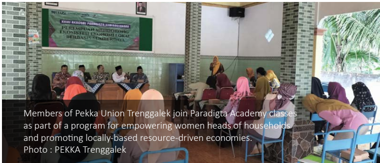
Members of Pekka Union Trenggalek join Paradigta Academy classes as part of a program for empowering women heads of households and promoting locally-based resource-driven economies.

PEKKA works through its Pekka Union branch Trenggalek District in 7 villages to access services and economic resources for women heads of households and other marginalised groups.