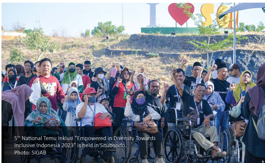
5 th National Temu Inklusi "Empowered in Diversity Towards Inclusive Indonesia 2023" is held in Situbondo.

SIGAB's local partner, Yayasan Pelopor Peduli Disabilitas Situbondo (PPDiS) , implements their SOLDIER Program in 6 villages in Probolinggo City and 8 villages in Situbondo District to fulfill the rights of people with disabilities in Indonesia to meaningful participation and consultation.