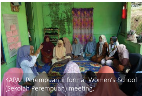
KAPAL Perempuan informal Women’s School (Sekolah Perempuan) meeting.

KAPAL Perempuan advocates for the implementation of the Law on Sexual Violence Criminal Acts (UU TPKS) passed in 2022. Advocacy to national and subnational governments seeks to encourage the drafting of regulations to ensure they meet the needs of women, people with disabilities and other marginalised groups.