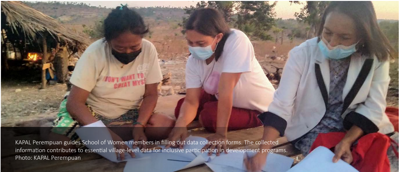
KAPAL Perempuan guides School of Women members in filling out data collection forms. The collected information contributes to essential village-level data for inclusive participation in development programs.

KAPAL Perempuan provides informal education through their Women's School ( Sekolah Perempuan ) initiative. Marginalised women are empowered and build their capacity to advocate for their rights. Local partner PEKA-PM implements the Sekolah Perempuan model in 5 villages in Kupang District .