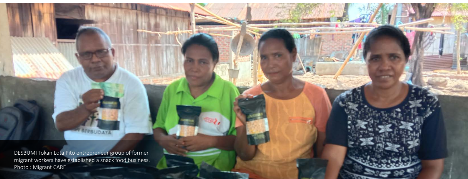
DESBUMI Tokan Lota Pito entrepreneur group of former migrant workers have established a snack food business.

DEBUMI also supports return migrant workers to develop alternative sources of income through formation of savings and loans groups and business cooperatives. Members conduct surveys on migrant's economic potential, access business training through the labour office, and participate in village development planning meetings ( musrenbangdes ) to secure funding for business proposals. The Lembata District government is supporting the expansion of DEBUMI to other villages in the district.