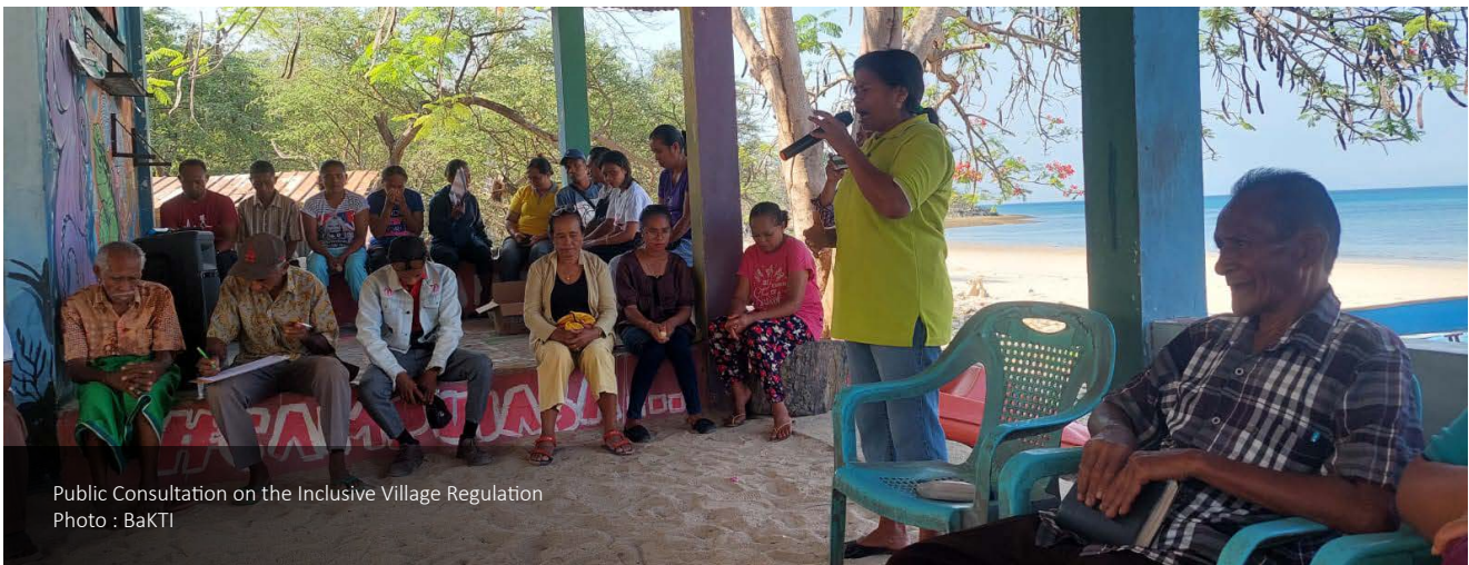
Public Consultation on the Inclusive Village Regulation

Village observer group members with disability have been working with government to collect data and formulate Inclusive Village (Desa Inklusi) regulations. The Inclusive Village regulation aims to address the rights of persons with disabilities to access government services and programs. This includes funding for wheelchair-accessible ramps and support their inclusive involvement in village development.